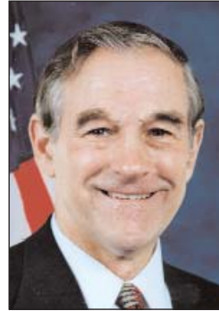
Ron Paul, M.D. REP. TEXAS 14 TH CONGRESSIONAL DISTRICT

and possibly other characteristics. The bill even provides for this sensitive information of American citizens